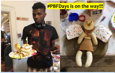
Dates of #PBFDays: October 21-29, 2017

#PBFDays is designed to recruit new TFJA partners (groups and individuals) & strengthen existing TFJA partnerships. #PBFDays will highlight the TFJA and the impact that houses of worship can have on the lives of its members/community through helping with their civil legal issues.